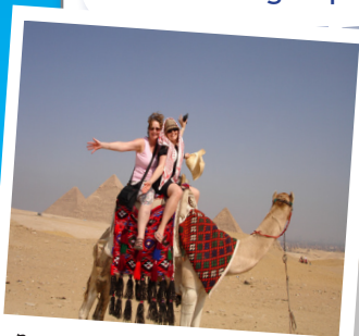
Pyramids of Giza