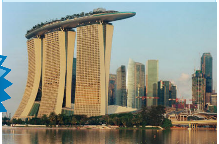
Marina Bay Sands