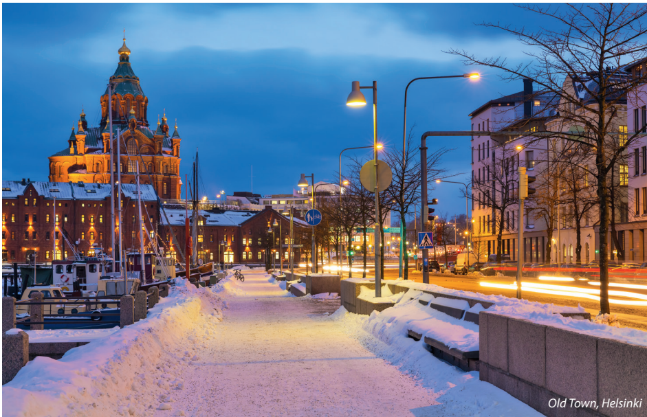
Old Town, Helsinki