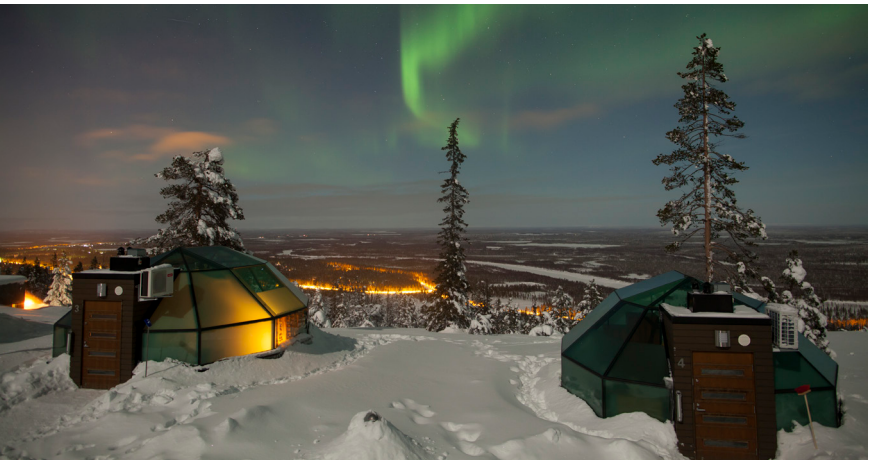
20 day fully escorted tour Departing Tasmania 23 January 2017