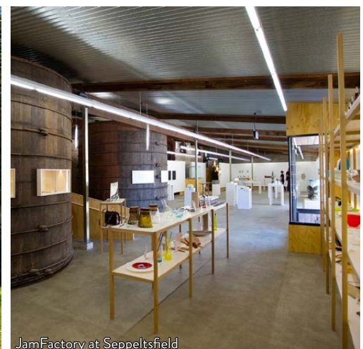
JamFactory at Seppeltsfield