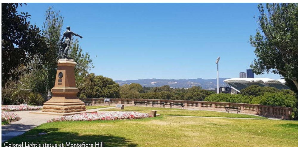
Colonel Light's statue at Montefiore Hill

Accommodation: Novotel Barossa Valley Resort (1 night).