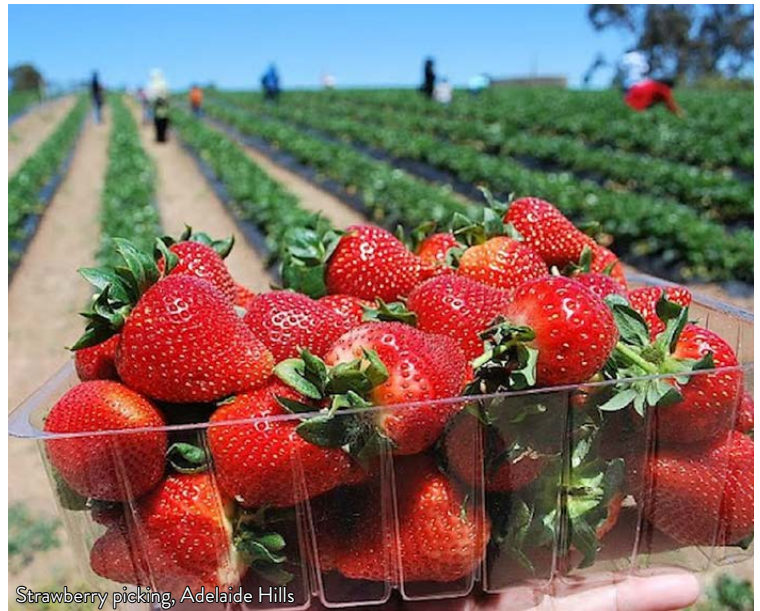
Strawberry picking, Adelaide Hills

We have asked the Wirra Wirra kitchen to give us the “feed me” menu for today’s lunch, which is bound to be scrumptious. Next, we travel back to Adelaide for our final night, with dinner at our hotel. B, L, D