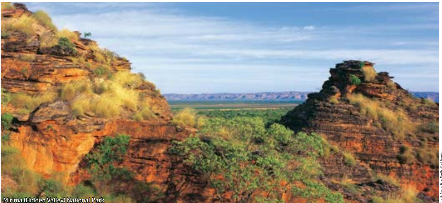
Mirima (Hidden Valley) National Park

It's not every day that you get to go behind the scenes of a rum distillery with the family that owns it. Meet the makers, and discover how Hoochery Distillery makes its lip-smacking, award-winning rums and whiskeys. Try a tasting paddle to