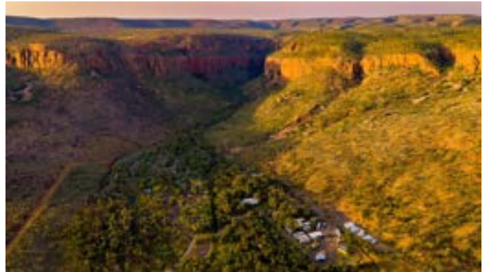
Emma Gorge Resort (Tented Cabin with private facils) (2 nights)