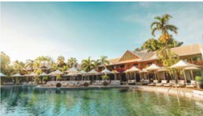
Cable Beach Club Resort & Spa (2 nights)