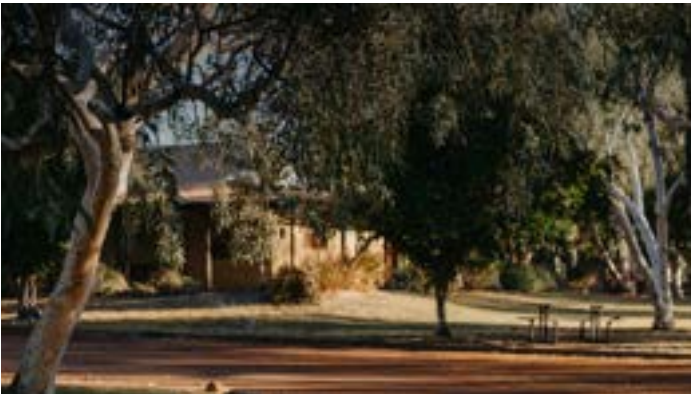
Kimberley Hotel (Halls Creek) (1 night)