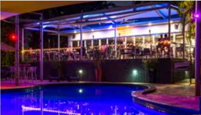
Kununurra Country Club Resort (2 nights)