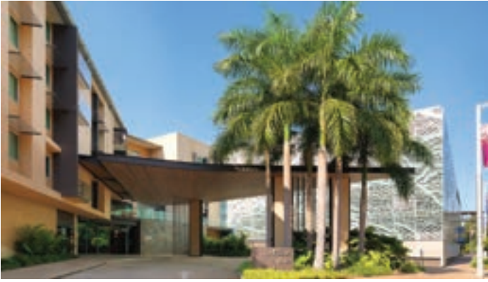
Vibe Darwin Waterfront (1 night)