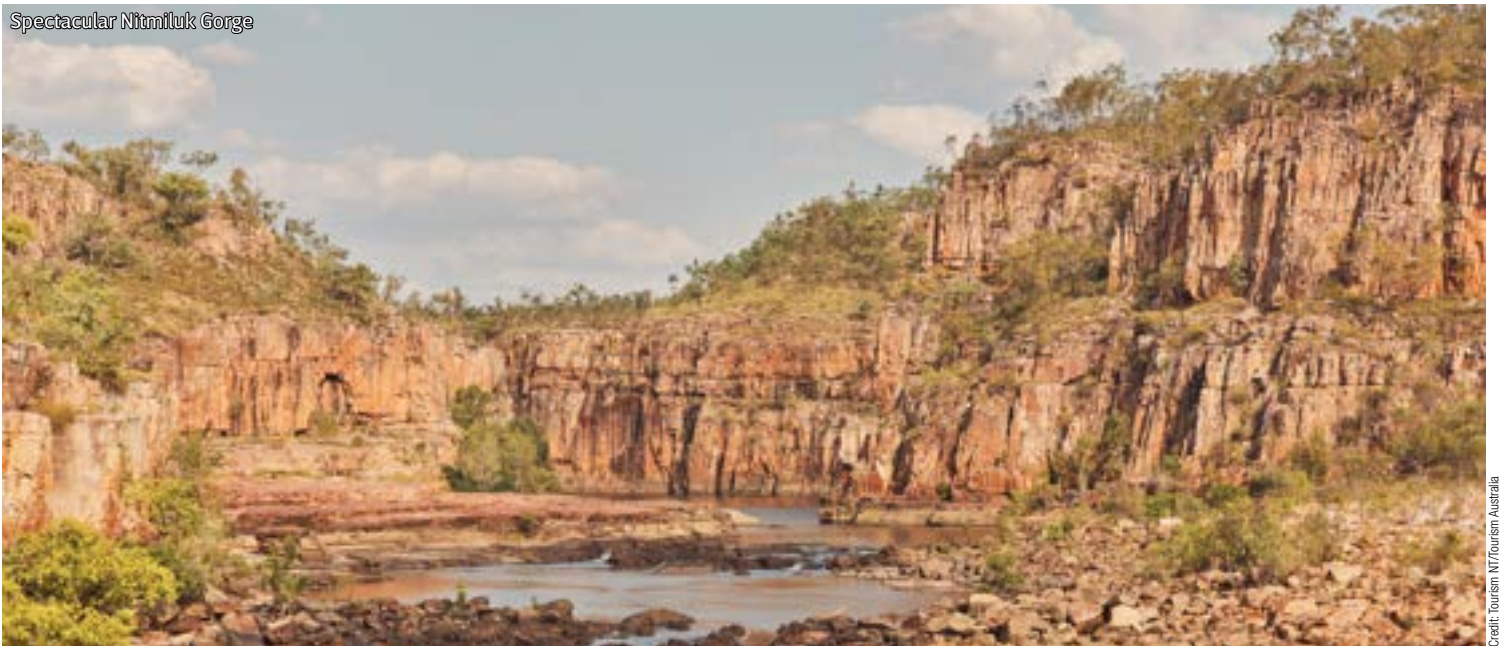
Spectacular Nitmiluk Gorge

This row: Credit: Tourism Western Australia