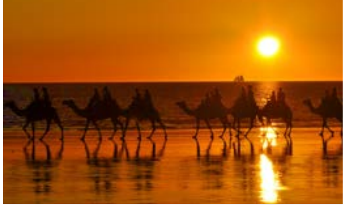
Sunset camel ride at Cable Beach, Broome (own optional experience)