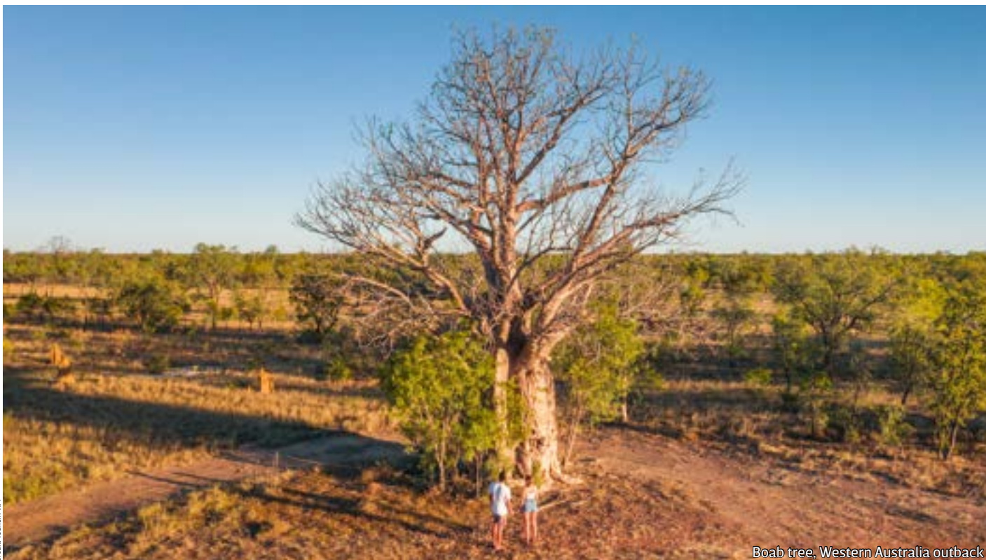
Boab tree, Western Australia outback

get your heart started (own expense) and then sit down to morning tea. Get a taste of the Gibb River Road before arriving at El Questro Wilderness Park. Your safari-style tents for the night are backdropped by the Cockburn Range, surrounded by an oasis of pandanus palms. When darkness falls, expect a bedazzlement of stars overhead.