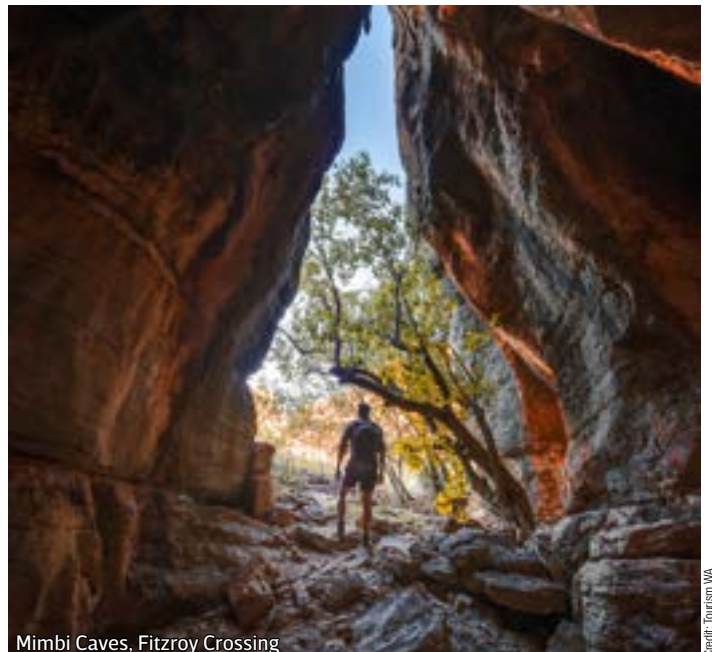
Mimbi Caves, Fitzroy Crossing