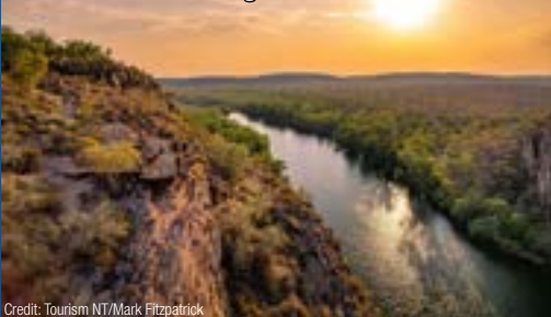
Nitmiluk (Katherine) Gorge