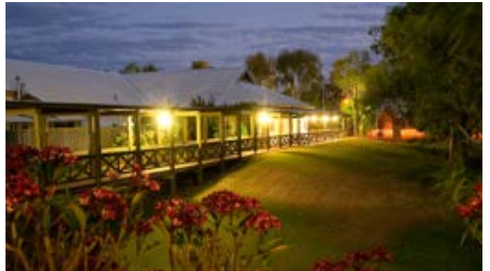
Fitzroy River Lodge (1 night)