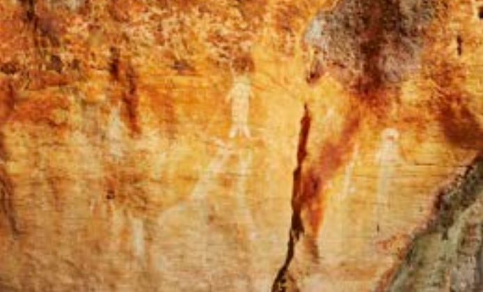
Gooniyandi rock art, Mimbi Caves, Fitzroy Crossing