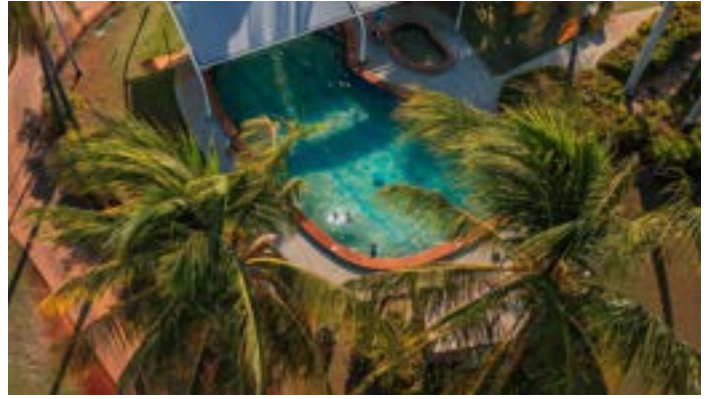
Contour Hotel (Katherine) (1 night)